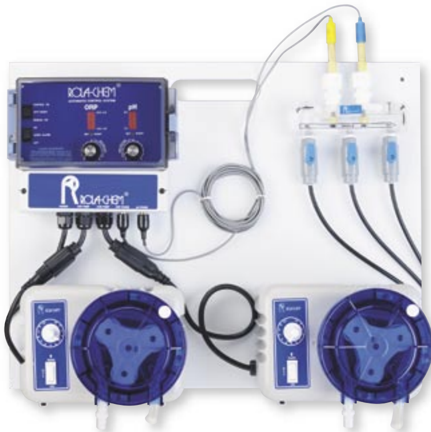
ORP/pH Analog Control System

For Use With Liquid Chlorine & Acid, Calhypo & Acid or Bromine & Acid