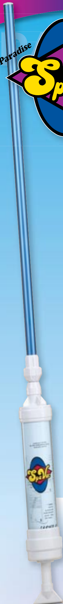
Paradise Spa Vac™

The PARADISE SPA VAC™ is available in Blister Pack, Single Box, 6-pk. Display or 12-pk. Display configurations.