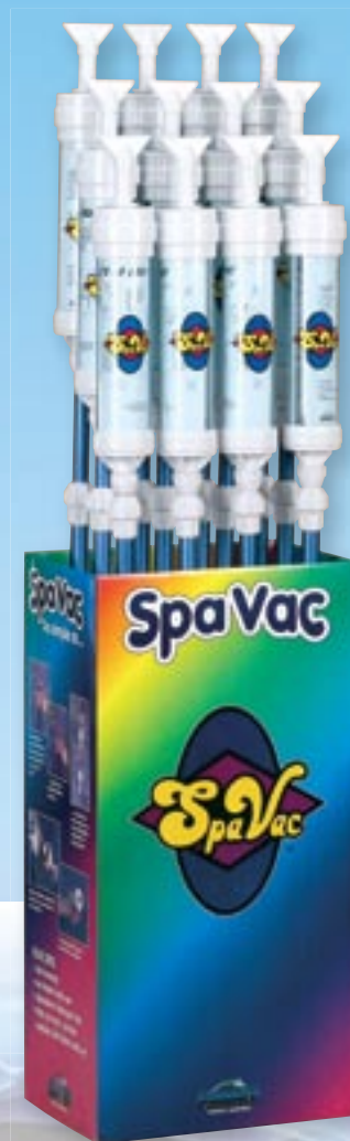
Paradise Spa Vac™ 12-pk. Display