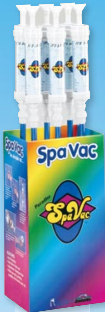
Paradise Spa Vac™ 6-pk. Display