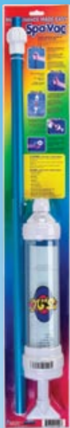
Paradise Spa Vac™ Blister Pack